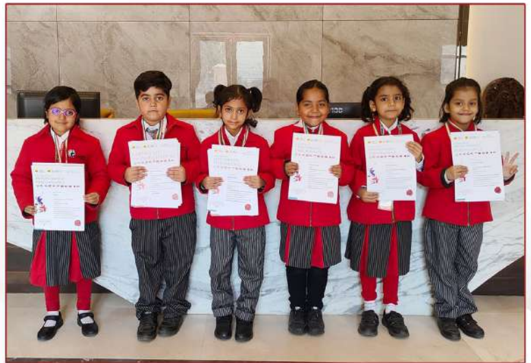
10 students from Grade 1 bagged Gold & Merit Certificates in NOF National Olympiads; Grade 7 also excelled.