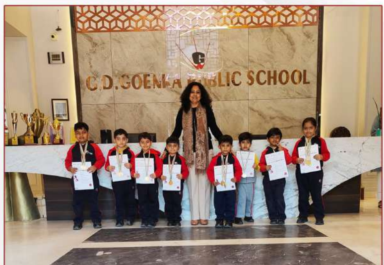
UKG stars sparkled at the NOF Junior Olympiads, earning golds and merit certificates across core subjects and advancing to the next round.